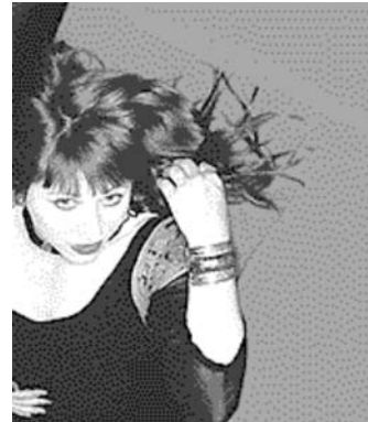
Lunch drunk: Lydia Lunch delivers a double dose of her intoxicating vision this weekend.